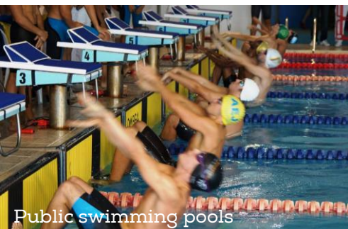
Public swimming pools

Throughout the year more than 20 walking and hiking events take place. Bragança has excellent conditions for the practice of ATB and running or jogging.