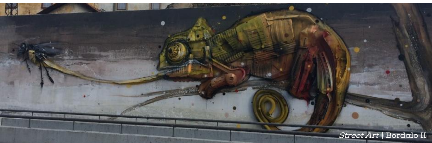
Street Art | Bordalo II