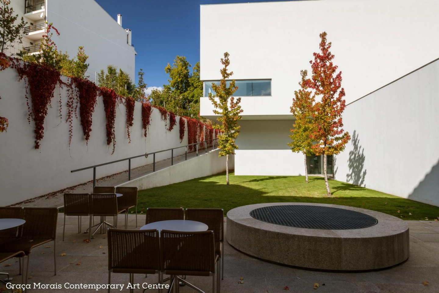
Graça Morais Contemporary Art Centre