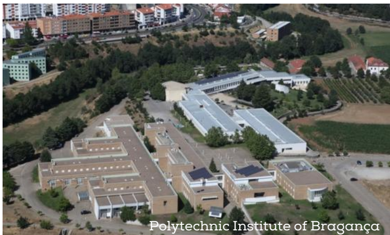
Polytechnic Institute of Bragança