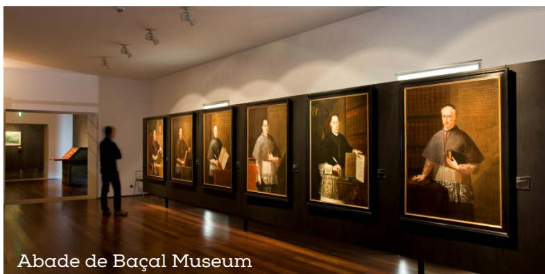
Abade de Baçal Museum