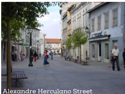
Alexandre Herculano Street