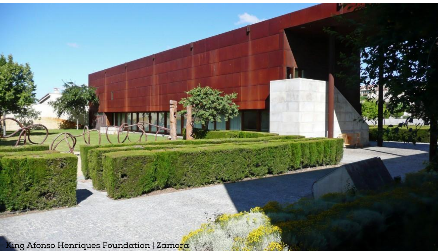
King Afonso Henriques Foundation | Zamora

Bragança has a cooperation network with Spanish institutions such as the Salamanca University and the Valladolid University as well as with entities and confederations supporting the investment, innovation and entrepreneurship.