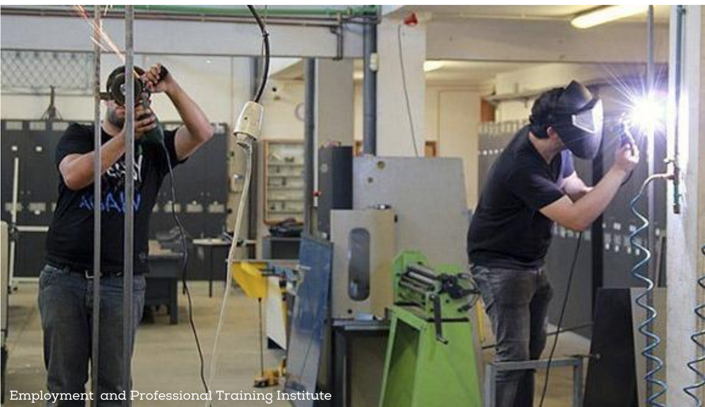
Employment and Professional Training Institute

There is a professional school, the Escola Prática Universal which teaches accounting, building construction, tourism and commercial services.