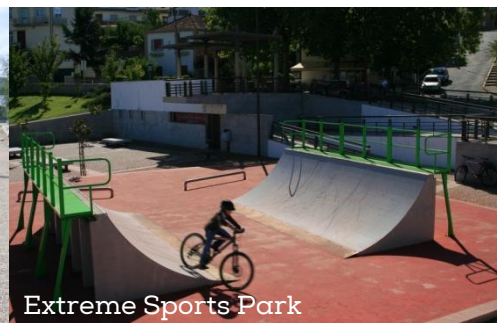
Extreme Sports Park