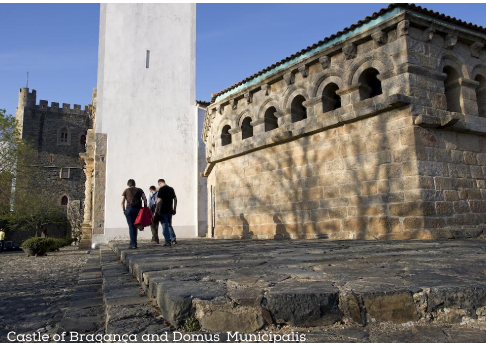
Castle of Bragança and Domus Municipalis

Bragança preserves an exclusive heritage in a compact Old Town that can be easily visited on foot. The worn-out stone of the Old Town are witnesses of the long history of the city, where the 15th century keep is highlights one of the most well preserved castles of Portugal. The citadel also houses a monumental set, which is truly worth visiting, such as the enigmatic Domus Municipalis. Beyond the walls of the castle, the roads guide the traveller along several churches. The Montesinho and Rio de Onor villages preserve buildings and traditions which deserve an attentive visit.