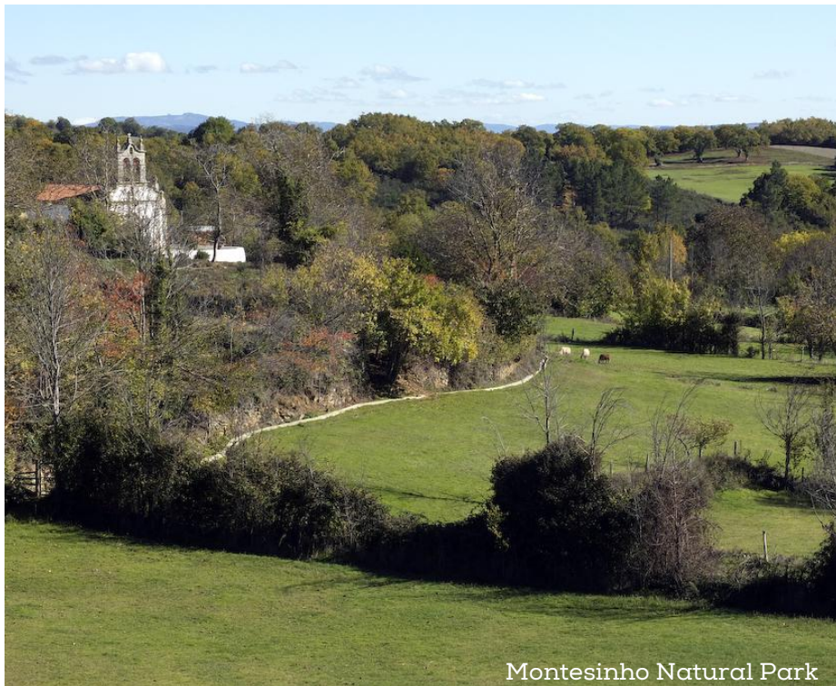
Montesinho Natural Park