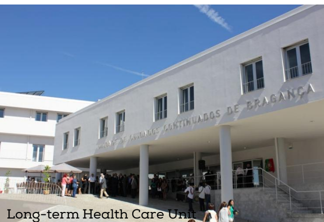
Long-term Health Care Unit

Bragança also has a cohesive social network, including several social responses that provide a more efficient answer to needs.