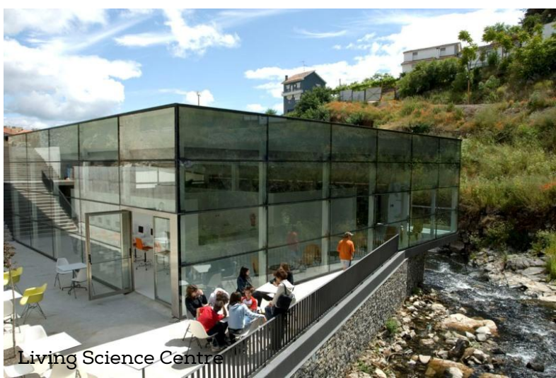
Living Science Centre