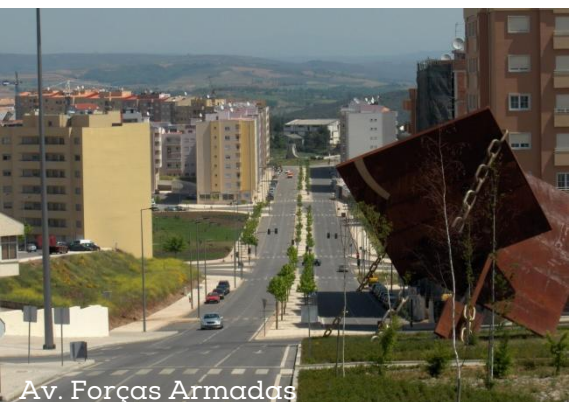
Av. Forças Armadas