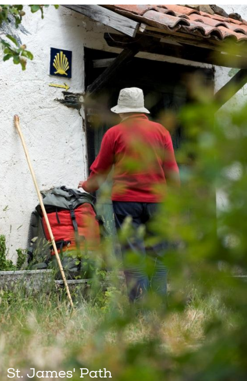
St. James' Path

The Montesinho Natural Park which is located in the entrance of Bragança has a unique biodiversity. It contains 80% of the mammals that exist in Portugal. The fabulous landscapes are composed by rounded hills and valleys fitted in the Sabor, Maças and Baceiro Rivers. This natural phenomenon forms several paths that allow people to go for a walk or to practise ATB as well as to take up St. James' Path and the Roman Antonine Itinerary.