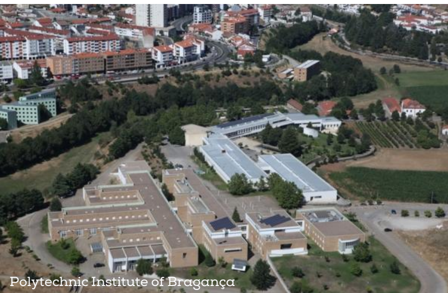
Polytechnic Institute of Bragança

The Polytechnic Institute of Bragança is a centre of creation, transmission and dissemination of culture, science, technology and art.